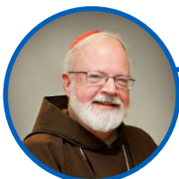
Cardinal Sean O'Malley, Archdiocese of Boston

"One of the unique things about Highland Street is their commitment to collaboration and also creating partnerships amongst folks that are funded."