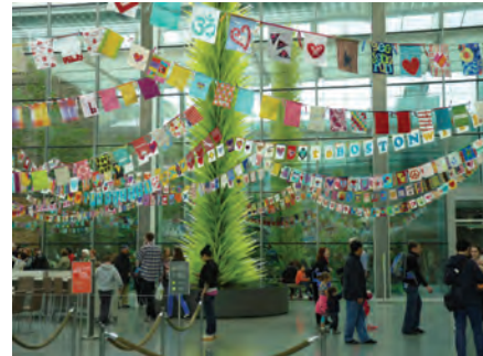
Exhibit was the fourth-most visited attraction in the museum's history.

Sponsored the 2011 Chihuly: Through the Looking Glass exhibition, featuring Dale Chihuly's 42-foot-tall Lime Green Icicle Tower.